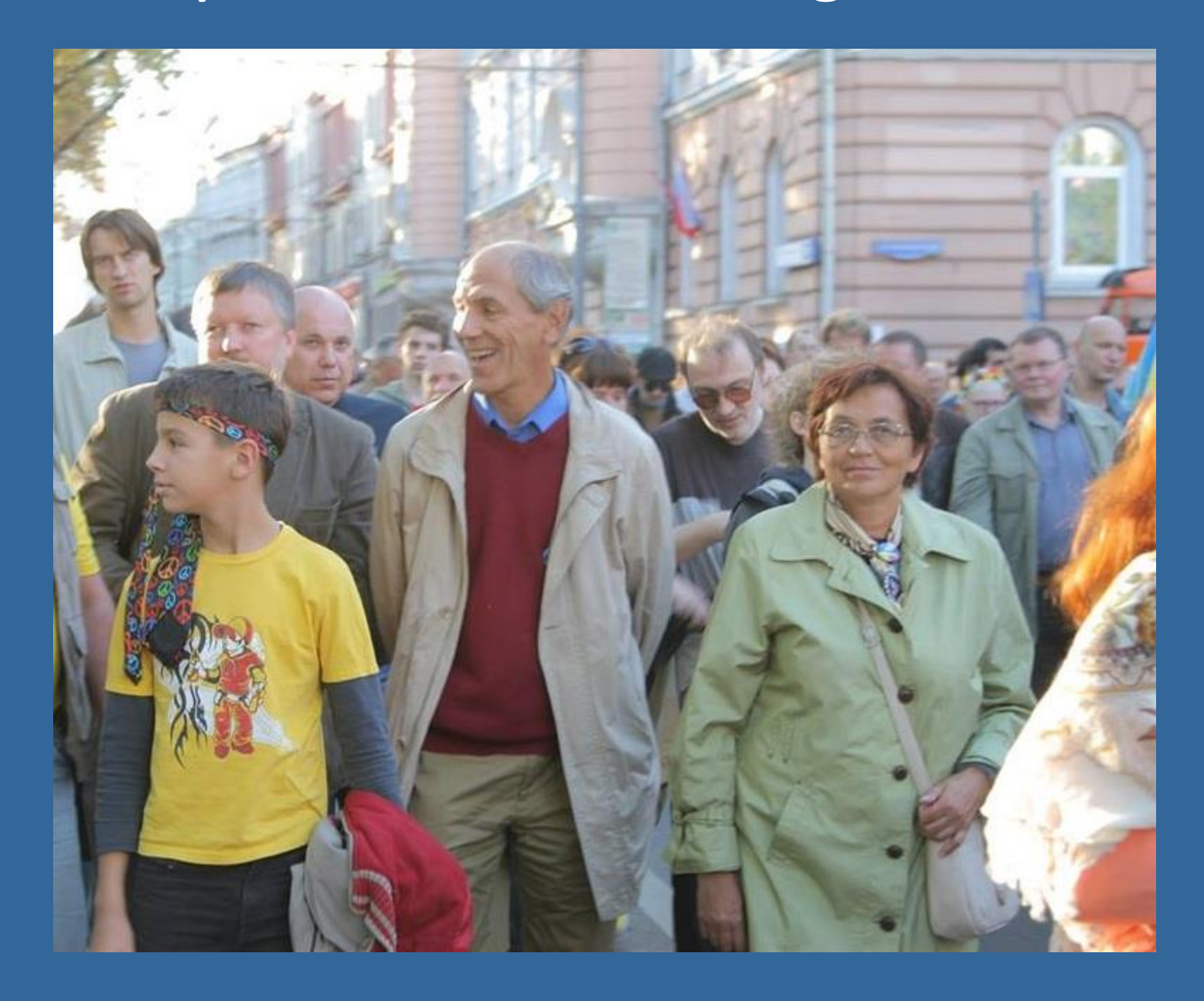
2014, September, Peace March